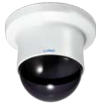
WV-QCD100G-W Dome Cover