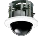
WV-QED100C-W Ceiling Mount Bracket