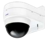
WV-QWD100G-W Wall Mount Bracket