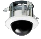
WV-QED100G-W Ceiling Mount Bracket