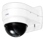
WV-QWD100C-W Wall Mount Bracket