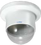
WV-QCD100C-W Dome Cover